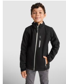
ANTARTIDA KIDS K6432